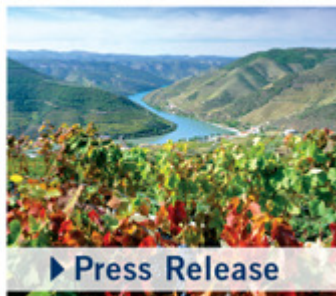
▶ Press Release