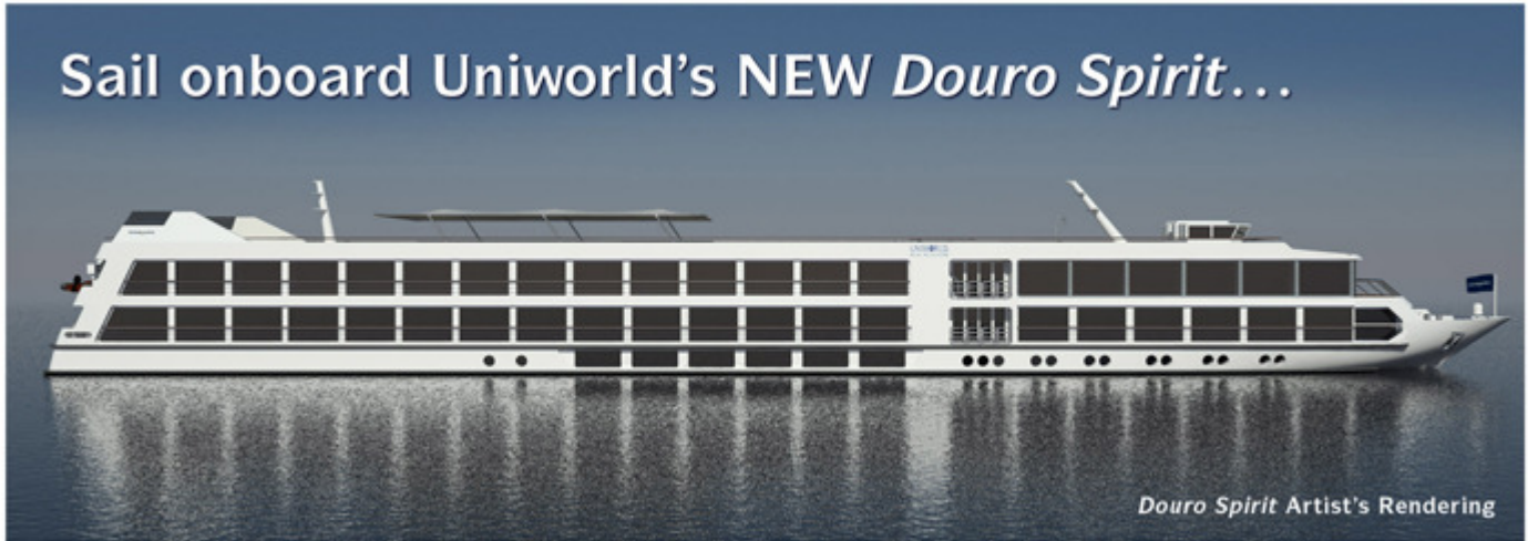
Douro Spirit Artist's Rendering